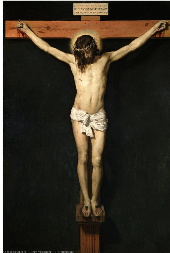
The Crucifixion, by Diego Velazquez

Friday, April 10, 2020 Good Friday 7:00 p.m.