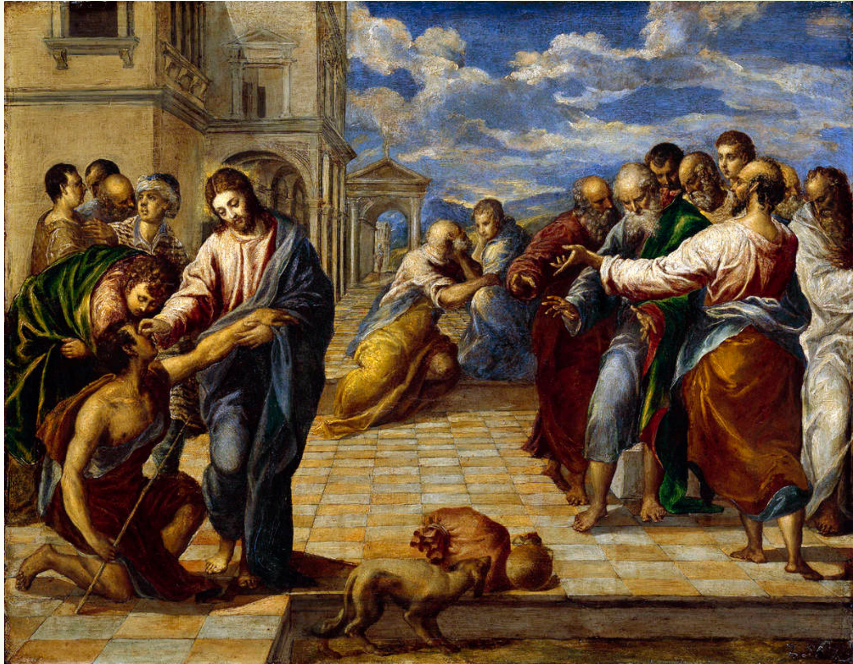
Christ Healing the Blind, By El Greco c. 1567